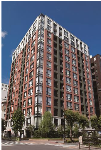
Prime Maison Ginza East (Location: Chuo-ku, Tokyo)