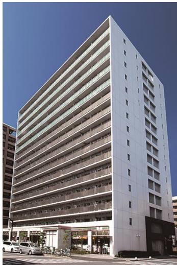
Esty Maison Ojima (Location: Koto-ku, Tokyo)