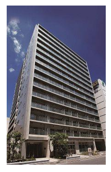
Completion: January 2008